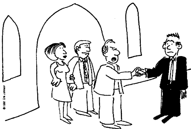
"I'd like to see you love my neighbor."